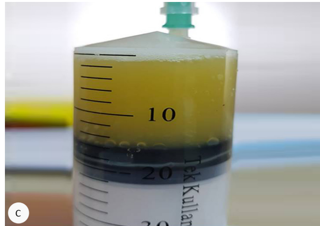
Figure 1. A) Transthoracic echocardiography (parasternal long-axis view), showing fibrinous pericardial effusion (arrows indicate the fibrin). B) Transthoracic echocardiography (parasternal short-axis view), showing the fibrinous pericardial effusion (arrows indicate the fibrin). C) Macroscopic imaging of the purulent pericardial fluid LV, Left ventricle; RV, Right ventricle

The patient underwent urgent echocardiography-guided pericardiocentesis. Totally, 600 cc of purulent pericardial fluid was drained (Figure 1C). Consultations were done with infectious disease specialists, who started an empiric antibiotic treatment with teicoplanin (1×400 mg/d) and meropenem (3×1 g/d). The microbiological culture of the pericardial fluid yielded Candida albicans ; consequently, caspofungin (1×50 mg/d) was added to the therapy. While the patient was on the parenteral antimicrobial therapy, an upper gastrointestinal tract endoscopy and abdominal computed tomography with oral contrasts were performed. There was no gastropericardial fistula, nor was there any leak at the anastomoses. During the follow-up, the patient's laboratory parameters, including the serum creatinine level, returned to normal limits and his urine output became normal. After an echocardiographic follow-up and the completion of 1 month of antibiotherapy, he was discharged from the hospital without any complications. During his follow-up, the patient remained asymptomatic and had no pericardial fluid for 6 months. In addition, no pathological 18 F-FDG (fludeoxyglucose) accumulation was observed on positron emission tomography.