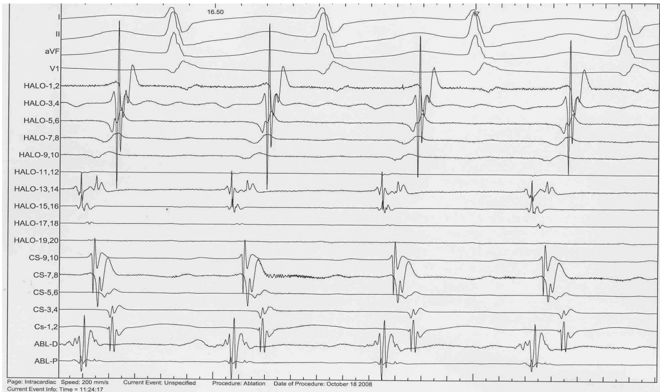
Figure 2. Surface electrocardiogram I, II, aVF, and V 1 and intra-cardiac recording during atrial tachycardia shows double potential in Halo 13, 14. Ablating catheter was at the orifice of right upper pulmonary vein