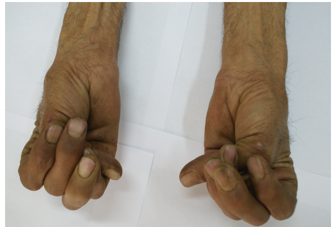
Figure 3. Positive thumb sign