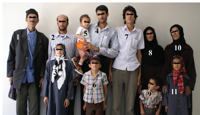
Figure 1. Family members with Marfan's syndrome. From left to right: father (1), first son and his daughter (2, 3), second son and his two sons (4-6), third son (7), second daughter and her son (8-9), and first daughter and her daughter (10-11)

The diagnosis of MFS is confirmed by clinical signs, although genetic and molecular tests enhance diagnostic certainty. Currently, the main diagnostic criterion is the Ghent nosology. 3 Cardiovascular disease (aortic dilatation and dissection) is the major cause of morbidity and mortality in MFS patients. 4