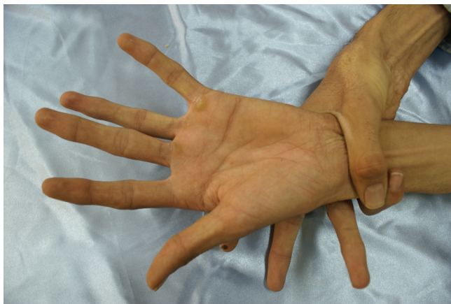
Figure 2. Positive wrist sign and arachnodactily

In 1998, a 17-year-old male (second son of this family) was referred to an ophthalmologist for visual disturbances. The ophthalmologic examination revealed lens displacement, iridodentosis, and high intraocular pressure. The patient's tall stature and arachnodactily (Figures 2 & 3) arouse the suspicion of MFS and he was referred to a cardiologist for further investigation. Echocardiography further established the diagnosis of MFS by demonstrating aortic root dilation and mitral valve prolapse (Figure 4).