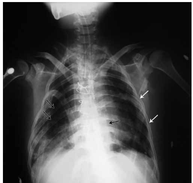
Figure 2. Chest x-ray of the patient (anteroposterior view) shows a small and bell-shaped thoracic cage (white arrows) with a round heart (black arrow in the middle). Thin ribs and slender long bones are also visible (black arrows on the ribs).

The patient's family history was not remarkable. Her parents were relatives, and she was the only person in the family with dwarfism and such disorders. Another finding of note was that the patient's external genitalia were normal and premature. Ultrasonography of the pelvis showed small ovaries with a few antral follicles and a small uterus. Chest CT scan demonstrated increased pericardial thickness