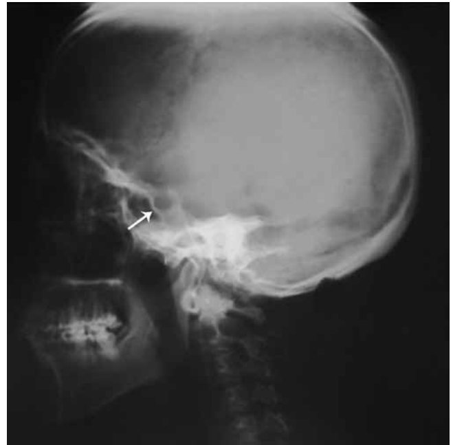
Figure 1. Lateral view X-ray of the patient's skull shows J-shaped sella turcica (white arrow).

Such characteristic findings as severe growth failure, short stature, thin extremities, peculiar high-pitched voice, hepatomegaly, and pericardial constriction all indicated Mulibrey nanism. Accordingly, the patient was subjected to further evaluation. Skull X-ray demonstrated a characteristic J-shaped sella turcica, which is a depression in the sphenoid bone at the base of the skull (Figure 1). Magnetic resonance imaging of the skull showed normal ventricles with no hydrocephalus. Chest X-ray revealed a round heart, a small and bell-shaped thoracic cage, and narrow shoulders (Figure 2). X-ray of the long bones showed slender bones. The patient had strabismus, and there was syndactyly on the right foot between toes 2 and 3 with abnormal nail growth. The existing literature does not include syndactyly in Mulibrey nanism; we are the first to report this malformation in conjunction with the Mulibrey nanism syndrome.