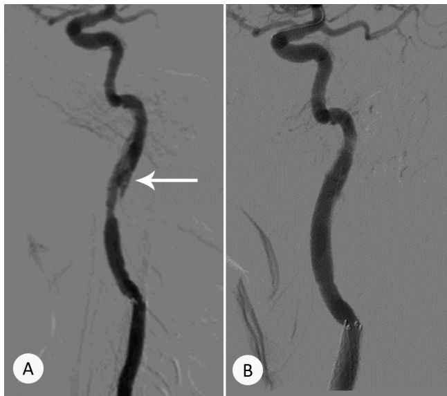
Figure 4. A) Left carotid angiography, showing dissection (arrow) in the internal carotid artery after stent graft placement; B) Final angiography after the deployment of the carotid stent, showing the sealing of the dissection

After a selective digital subtraction angiography of the left CCA, a 0.035-inch Terumo guide-wire (Terumo, Tokyo, Japan) was inserted via the femoral access into the left internal carotid artery. The guide-wire was then replaced with a super stiff one, and a 10-F long sheath (Shuttle introducer sheath – Cook Inc., Bloomington, IN) was inserted into the left CCA. Two overlapping self-expanding stent grafts (8×60 and 10×60 mm) were deployed into the left internal carotid artery and the left CCA, consecutively (Fluency, Bard, Covington, Ga). Post-stenting angiography showed a non-flow-limiting iatrogenic dissection flap, 20 mm distal to the position of the stent grafts. Nevertheless, a decision was made to cover the dissection site with a self-expanding 7×30 mm PRECISE Stent (Cordis, Johnson and Johnson, Miami, FL). The final angiogram showed no residual endoleak, and the flow of the carotid and cerebral arteries was satisfactory (Figure 4A and 4B).