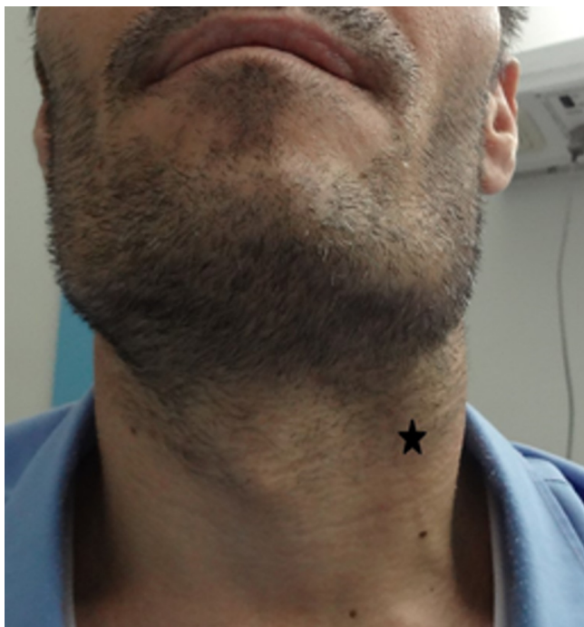
Figure 1. The patient, presenting with a left cervical mass (asterisk) in the anterior view

A 40-year-old man was admitted for a left-sided cervical mass, which was painful and pulsatile. In the month preceding his admission, the patient had 2 episodes of right-sided transient ischemic attacks. He denied any history of trauma, surgery, or irradiation to his neck, and he had no known history of systemic disease. He also complained of recurrent urogenital ulcers and aphthous lesions, together with painful rashes on his extremities, of 6 months' duration. On physical examination, there was a pulsatile mass in the left anterior cervical region (Figure 1).