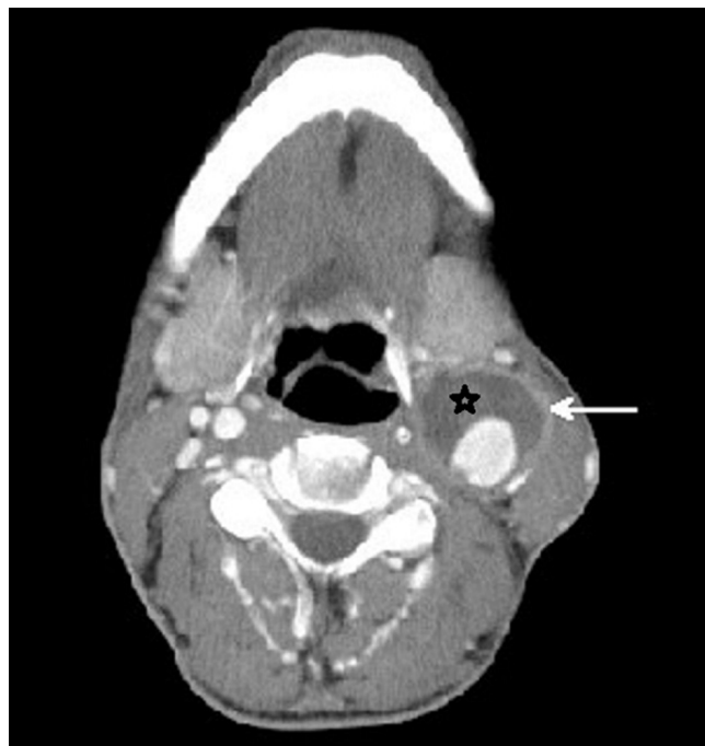
Figure 3. Contrast-enhanced computed tomography scan in the axial view, demonstrating an aneurysm (arrow), 41×30 mm in size, with a very large mural thrombus (asterisk)

The patient was referred to a rheumatologist, who established the diagnosis of BD on the basis of history, the presence of systemic inflammatory reaction, a positive