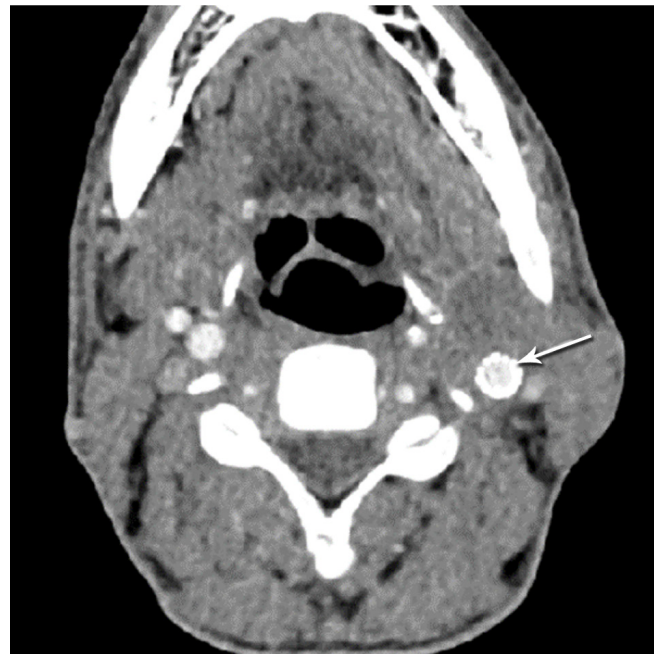
Figure 5. Follow-up computed tomography angiography in the axial view 6 months after the procedure, showing no residual aneurysm as well as the resorption of the mural thrombus (arrow)

The follow-up ultrasonography and computed tomography angiography of the patient 6 months later showed no endoleak or any other problem, and there was significant shrinkage in the aneurysm sac (Figure 5).