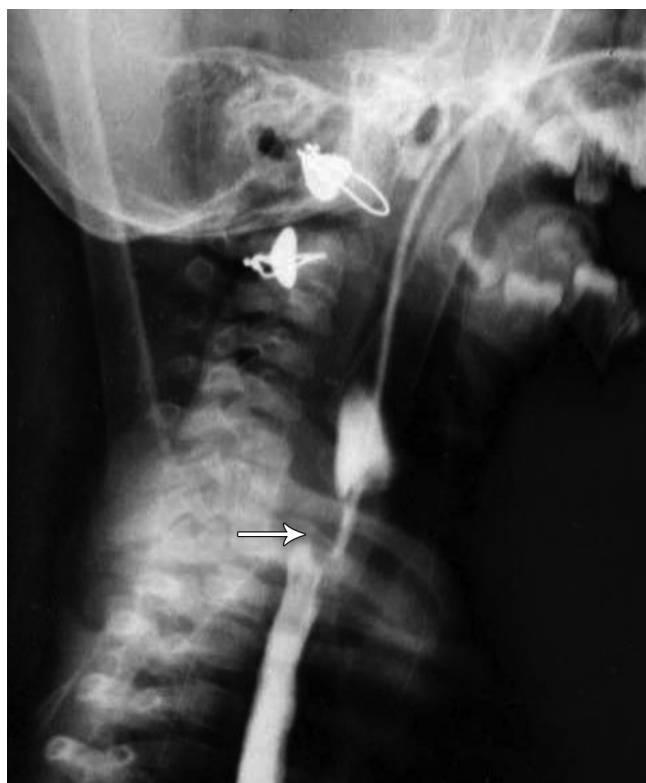
Figure 1. Patient's barium meal, X-ray, showing pressure effects on the esophagus (arrow).

with suspicion of the VACTERL syndrome, showed no VSD or PFO but a left superior vena cava was observed. Computed scan angiography revealed a pulmonary artery sling and the origination of the left vertebral artery from the aortic arch (Figure 2 and Figure 3). As the patient had a history of imperforated anus, single kidney (Figure 4), and cardiovascular involvement, the VACTERL syndrome was diagnosed for her.