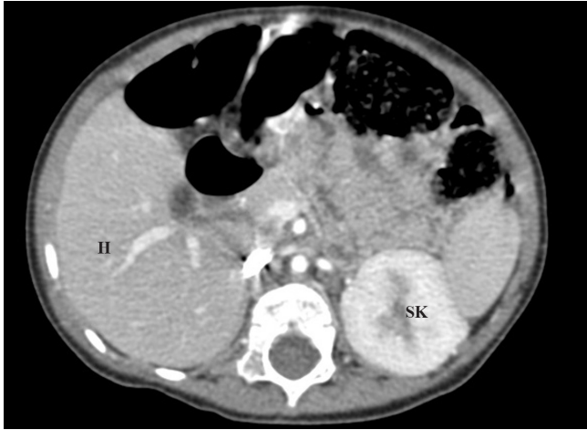
Figure 4. Abdominal computed tomography scan, axial view, showing apparent hepatomegaly and a single kidney. H, Hepatomegaly; SK, Single kidney