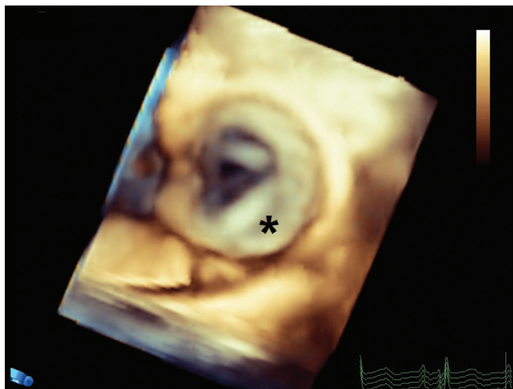
Figure 2. En face view of the pulmonary valve in 3D transesophageal echocardiography, showing that the tip of 1 pulmonary cusp is attached to the sinotubular junction (*).