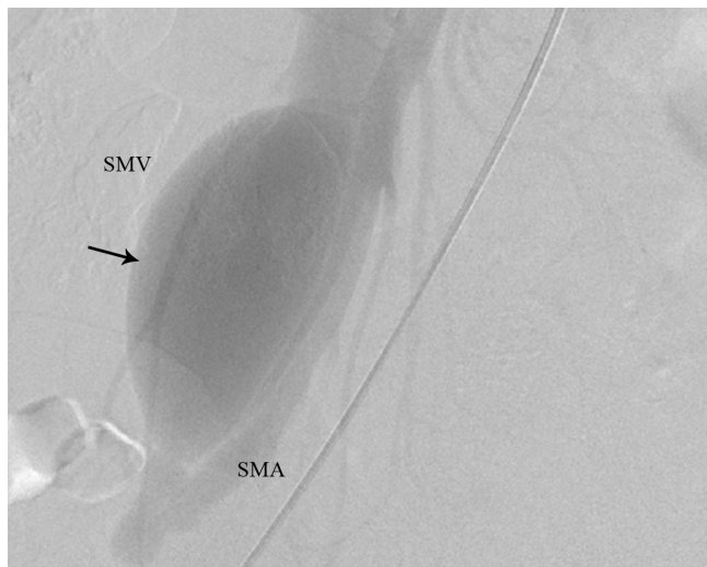
Figure 1. Lateral view of the abdominal angiography of the SMV and SMA before coil embolization (The arrow shows the site of the fistula before coil embolization.)

We decided to perform coil embolization (Cook) at the fistula site. Therefore, we inflated a 5-mm balloon catheter (Ev3, EverCross OTW balloon catheter) before the fistula to prevent coil migration with a high blood flow. After the balloon inflation, we deployed one 8-mm and two 7-mm coils at the fistula site. The final angiography showed successful embolization with no visualization of the fistula or the aneurysmal vein (Figure 2).