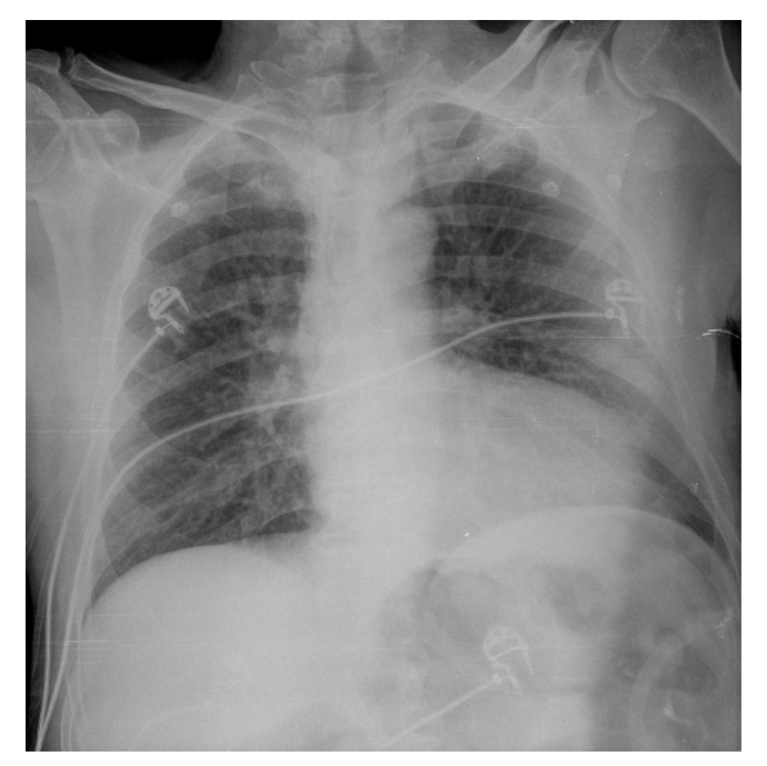
Figure 1. Chest X-ray of the patient in the posteroanterior view, failing to demonstrate the foramen

Acute coronary syndrome was diagnosed by the cardiology department, and an urgent selective coronary angiography was planned. The coronary angiography confirmed the diagnosis of coronary artery disease, and the patient underwent urgent coronary artery bypass grafting. As urgent revascularization was planned, no advanced imaging modalities were used preoperatively, except for chest X-ray (Figure 1). Written informed consent was obtained from the patient, and the patient was prepared for the operation.